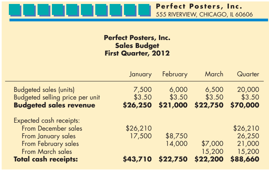
Figure 14.4 Perfect Posters’ Sales Budget

Accountants follow standard reporting practices and principles when they prepare external reports. The common language dictated by standard practices and spelled out in GAAP is designed to give external users confidence in the accuracy